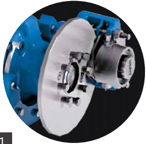
1 PARKING BRAKE