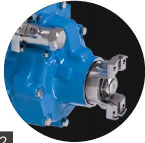
2 REAR AXLE DISCONNECT